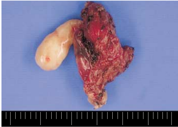
Fig. 1. Gross photograph of right tonsillectomy specimen. A Polypoid mass extends from tonsil, showing smooth surface. [left: polyp, right: tonsil] (case 1).

physical examination revealed a firm protruding mass from the left tonsillar surface.