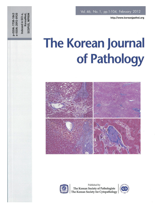
Fig. 4. The first all-English issue of the Korean Journal of Pathology in 2012.