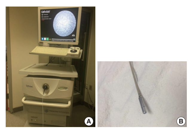
Fig. 4. Cellvizio system for probe based confocal laser endomicroscopy (A) and a probe (B).