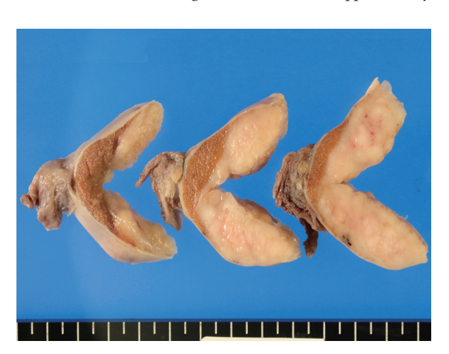
Fig. 1. The cut surface of the resected specimen shows a whiteyellow, solid mass measuring 5.0 cm in the right testicular parenchyma.

The peripheral monotonous lymphoid cells were immunore-active for CD20, CD79a, CD5, and CD23 and negative for CD3, CD21, CD10, and cyclin D1 (Fig. 2E, F). Kappa light chain restriction was detected during flow cytometry using the resected specimen. Considering that the patient's circulating lymphoid cell count was > 5.0 \times 10^3 / \mu L at admission, the peripheral component of the tumor was diagnosed as testicular involvement of CLL. Immunostaining for CD21 revealed a retained follicular dendritic-cell meshwork in the lymphoid stroma of the seminoma (Fig. 3A). The Ki67 labeling index in the lymphoid stroma of the seminoma was much higher than that in CLL (approximately